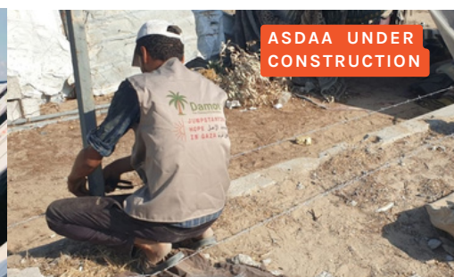
ASDAA UNDER CONSTRUCTION