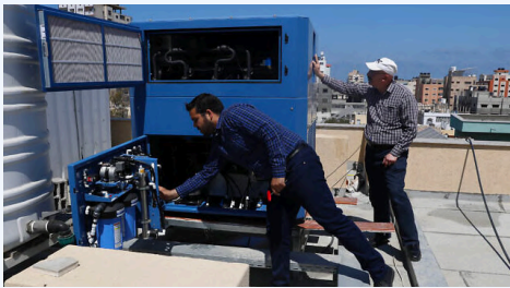
Atmospheric Water Generators (AWG) in Gaza See article

The essential supply of water, sanitation, and hygiene (WASH) and energy services for 2.2 million Palestinians in Gaza cannot wait.