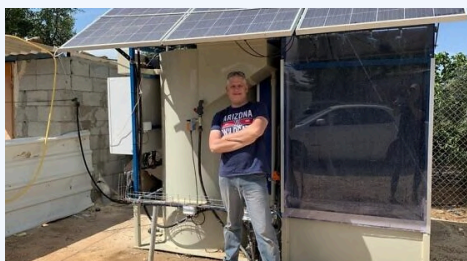
Off-grid wastewater treatment plants (WWTP) See article