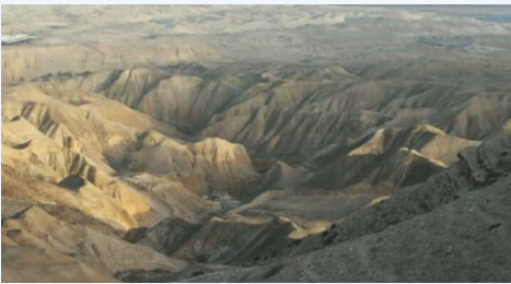
Treated wastewater trunkline in the Jordan Valley See article